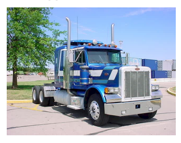
Figure 3. Jakes exhaust brake muffler fitted to a large truck

Engine brake noise is the greatest source of community complaint against the heavy vehicle industry in Australia. Not only does it adversely affect a large part of the population in all areas of the country, but it also has the potential to adversely affect heavy vehicle productivity because of demands for curfews and other restrictions arising from affected populations.