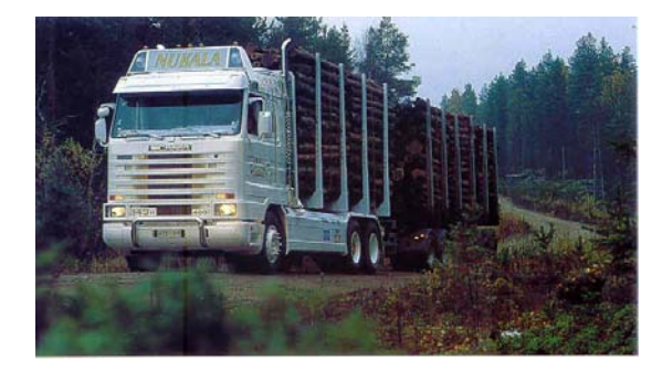
Figure 2. Heavy vehicle traversing rural area entering village

There was minimal road traffic prior to 1990 in villages near the border of the former German Democratic Republic. As a result no by-pass roads were built, but after the reunification of Germany the situation changed dramatically in some villages. One example is Barbis, Bad Lauterberg, near the Harz Mountains. Heavy goods traffic from the Hanover region to the Halle-Bitterfeld industrial area flows day and night through the narrow streets. On average every 2 minutes during the night, a heavy truck passes by the houses within a distance of 1-3 m. Complaints from the community were referred to the Federal Environmental Agency for investigation and a pilot study was planned to investigate potential health effects.