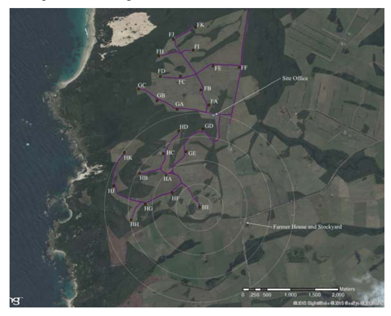
Figure 1: Studland Bay Wind Farm

Tasmania, Australia. The wind farm development was commissioned in 2007 with 25 3 MW Vestas V90 turbines<sup>6</sup>. The calibrated recordings were obtained from the Studland Bay Wind Farm over a period of 14 consecutive days in March 2013. A comprehensive matrix of scenarios was developed to capture wind turbine sound under various environmental conditions. A single turbine<sup>7</sup> was isolated as far as practical from the cluster of turbines and presented in Figure 2 as Turbine HE.