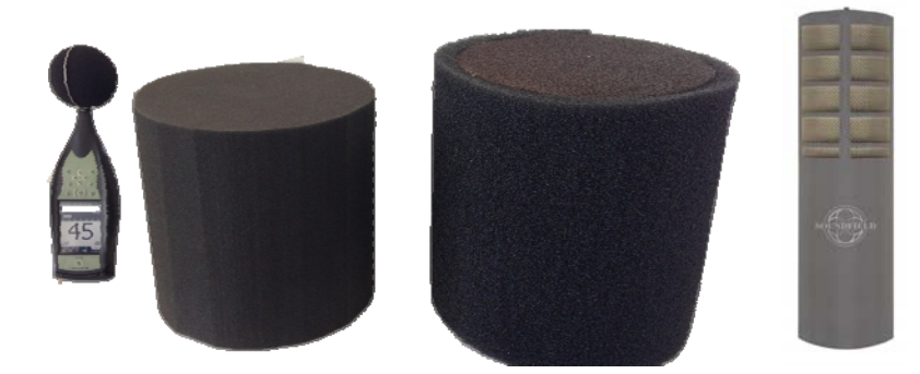
Figure 1: Schomer Windshields and SoundField® microphone

Since it is so windy around the wind turbines Arup have developed foam microphone windshields to minimise the low-frequency interference from turbulent wind pressure acting on the microphone capsule. The custom wind-shields for both the noise loggers and the SoundField® microphone assisted to minimise the impact of low-frequency wind noise. These enormous foam windshields are based on a design by Schomer<sup>5</sup>, and are designed to reduce low-frequency wind noise on the microphone capsule by around 30 dB. An image of the microphone and wind shields are presented in Figure 1.