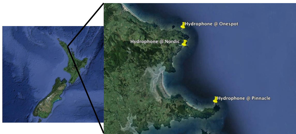
Figure 1: Map showing the locations of Nordic Reef, Pinnacle and OneSpot in northeastern New Zealand. Exact hydrophone deployment locations are marked with yellow pins.

shallow reef habitats behave as extended sound sources, exhibiting a “reef effect” whereby sound intensity surrounding a reef does not decrease over a radial distance approximately equal to the length of the reef (20). Thus, all hydrophones were positioned within this reef effect zone to avoid signal degradation. Two-minute sound bites were recorded every 15 minutes at 144 kHz and 16 BITS. Preliminary data were taken over a three-day period from the 28 February to 02 March 2014, centered on the summer new moon. Sixty-second samples of each two-minute recording were used. Since relevant biological sound should not occur outside of the 50 Hz – 24 kHz frequency range, all recordings were subjected to a bandpass filter with these limits.