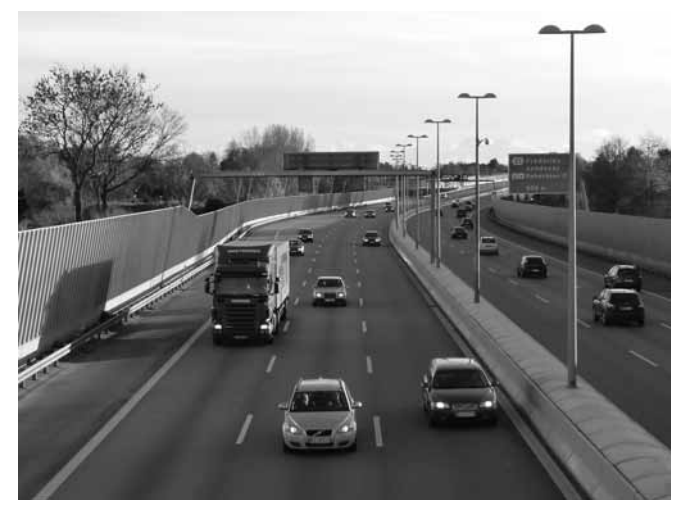
Figure 2. The M3 highway once completed, with porous asphalt and tilted 3m and 4m noise barriers.