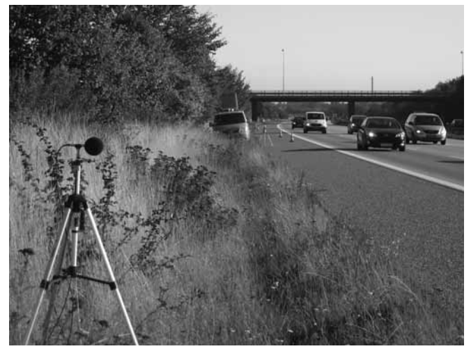
Figure 3: The Danish Road Institute measures the noise level at a test location for noise reducing pavement using the SPB method.