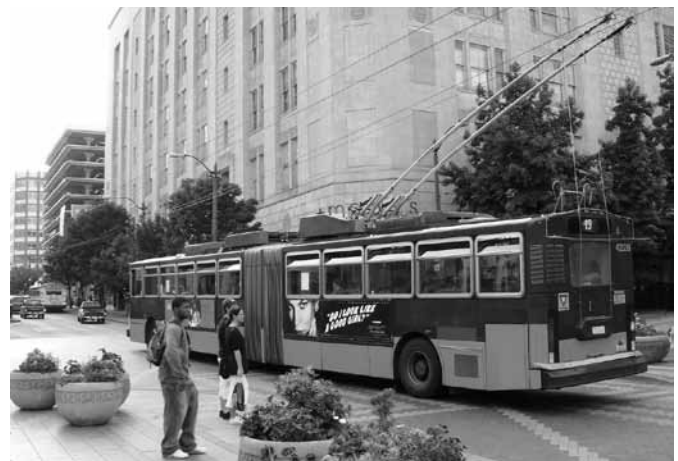
Figure 4. Trolley bus in Seattle, USA, in 2008