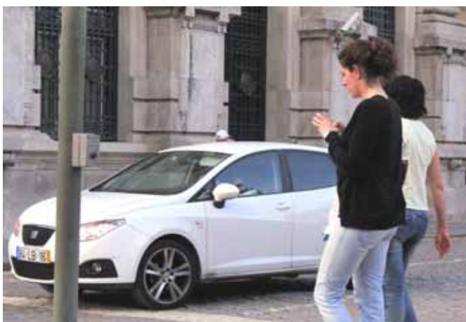
Figure 3. Woman crossing a street while “texting” (Braga, Portugal)

Therefore, the potential problem of missing sound cues is not new and occurring only recently with the modern EVs and HEVs. It has existed for a long time and yet significant accident types caused by the quietness of vehicles have not