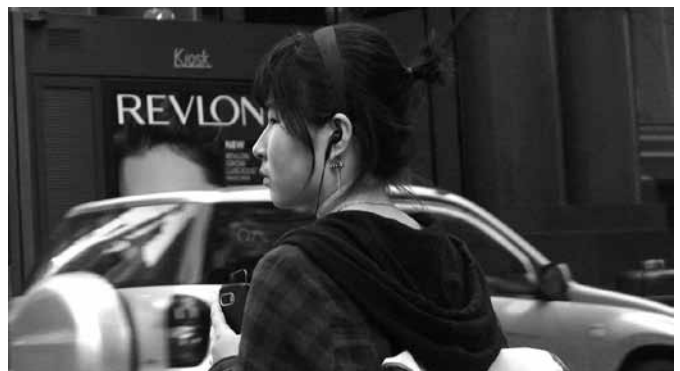
Figure 2. Woman crossing a street while listening to something in her earphones (Sydney, Australia)

The New York State “distracted walking legislation”, first proposed in 2007, would keep pedestrians who are in crosswalks from using handheld cell phones, Blueberries, MP3 players such as iPods, PDAs and similar attention-grabbing devices. The proposal restricts the law to cities with a population of at least 1 million, meaning only Manhattan [24]. However, as far as this author could find, it has not yet materialised into a law.