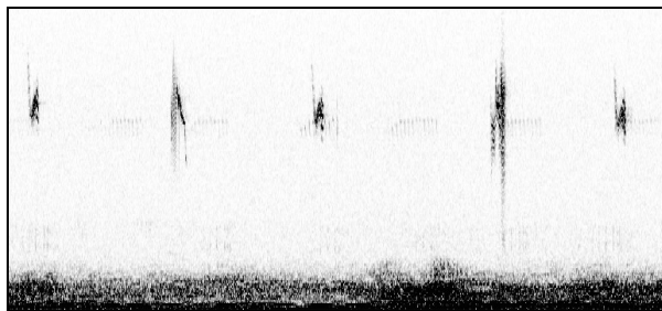
Figure 1. Spectrogram of a field recording of five OBP flight calls. The vertical scale is linear frequency for 0 to 10 kHz and the horizontal axis is 6 seconds duration. Low frequency noise was from a light aircraft and there is a harmonic of an insect sound at about 6 kHz.

The OBP has several quite distinctive calls. The flight call exhibited during localised movements and migration is described as a single 'zeet' usually emitted at the apex of an undulating flight pattern. This call is repeated about once a second, between about 5.5 and 8 kHz characterized by an inverted 'V' frequency versus time spectrogram, as shown in Figure 1 . The amplitude profile has a 'classic fish skeleton' shape as shown in Figure 2 . Most chirps follow these general patterns although there can be significant variations in spectral and temporal characteristics. The OBP flight call is quite obvious to a trained observer. At times of restricted visibility, during rain, mist or in the evening, the birds can often be identified by their call well before visible confirmation.