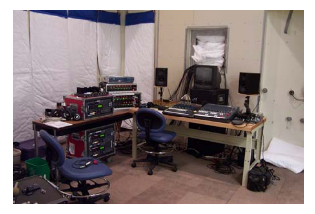
Figure 5. Recording and Monitoring Equipment

Proceedings of the International Symposium on Room Acoustics, ISRA 2010