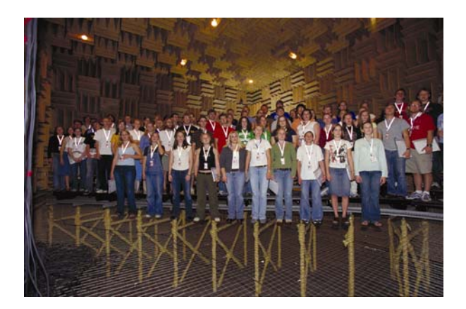
Figure 6. St. Olaf Cantorei Choir

All recording was done directly from the microphones to a dedicated preamp to the digital recorder. No mixing was done during the recording session. Previous discussions with the recording team and the choral director had concluded that there would be no overdubs during the recording session. Each song was complete from start to finish as performed (Figure 6). Due to ventilation background noise in the chamber, the system was stopped for each recording and switched back on during the breaks between songs. Gradually the temperature increased in the chamber, even with the ventilation between songs. Eventually, some students became overheated and experienced symptoms of claustrophobia.