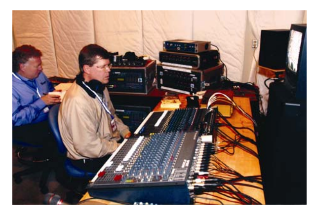
Figure 7. Tom Mudge engineering

The actual recording session of the six songs was completed in 1.5 hours due to the extensive rehearsals conducted by Dr. Ferguson and the St. Olaf Cantorei Choir; the planned evening recording session was unnecessary (Figure 8).