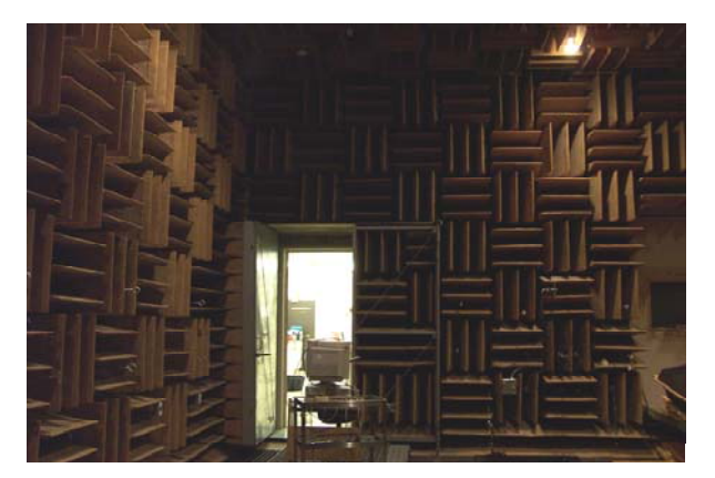
Figure 1. 3M Anechoic Chamber

The chamber and nearby reverberation rooms are now used to support material research and application development activities for Thinsulate Acoustic Insulation and 3M's worldwide acoustics businesses. 3M generously donated the use of these facilities, along with support personnel to assist the project. The chamber measures 7.6m (25ft) by 9.1m (30ft) by 6.1m (20ft) with a suspended grid 1.5m (5ft) above the absorptive wedge floor.