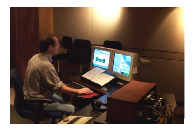
Figure 10. Mastering Audio CD

The DVD included all usable tracks from the recording session, allowing others to experiment with other microphone/methods/mixes for auralizations. The DVD contains both 16bit and 24bit .wav file formats recorded at 44.1kHz (Figure 10).