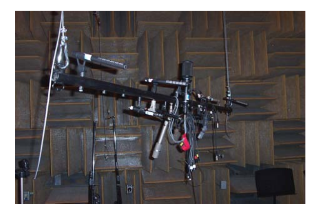
Figure 4. Microphone Bar

Selection of the recording equipment was driven by the desire to capture as much high-quality information as possible, since the likelihood of replicating this event in the near future would be difficult. The recording session was captured on 24 tracks of 24-bit digital audiotape. Eight different microphone configurations were used concurrently for the recordings (Figure 4). These included: A-B spaced pair of matched DPA 4003 omni-directional microphones spaced 61cm (24in) apart; A-B spaced pair of B&K 4007 omni-directional microphones spaced 91cm (36in) apart; ORTF method Neumann KM140 pair of cardioid directional microphones; ORTF method Schoeps CMC5-MK5 pair of cardioid directional microphones; A-B spaced pair B&K 4011 cardioid directional microphones spaced 122cm (48in) apart; A-B spaced pair Neumann KM184 cardioid directional microphones spaced 61cm (24in) apart; Four "shotgun" Audio Technica AT4073A microphones spaced in pairs at 91cm (36in) and 122cm (90in) with each microphone aimed at one quarter of the choral group; X-Y method Schoeps X/Y CMXY cardioid stereo microphone at 90 degrees. Installed but not used due to technical issues were X-Y method Neumann SM69 and ambisonic method Calrec Soundfield MKVI microphone.