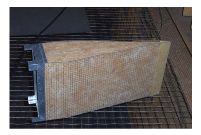
Figure 2. Fiberglass wedge

The chamber and nearby reverberation rooms are now used to support material research and application development activities for Thinsulate Acoustic Insulation and 3M's worldwide acoustics businesses. 3M generously donated the use of these facilities, along with support personnel to assist the project. The chamber measures 7.6m (25ft) by 9.1m (30ft) by 6.1m (20ft) with a suspended grid 1.5m (5ft) above the absorptive wedge floor.