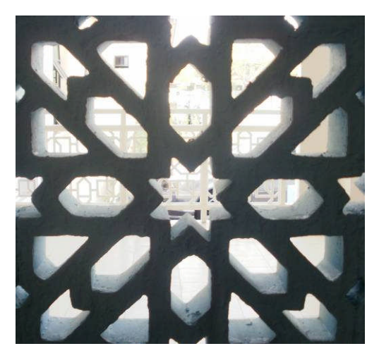
Figure 4. Details of Taman Putri Kulai mosque perforated panel

Figure 5 shows the perforated panel as part of the back wall while Figure 6 shows the perforated panel as part of the right side wall. These two figures indicate, the use of perforated panel in this mosque is rather minimal. As can be seen from Figure 5 and Figure 6, the rest of the wall is mainly of glass panel. Only small part of the wall is made from full concrete pillar to support the mosque load structure.