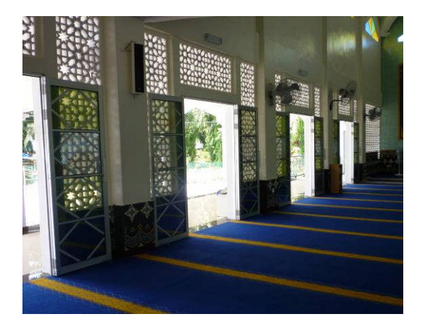
Figure 3. Left side wall with perforated panel on part of wall