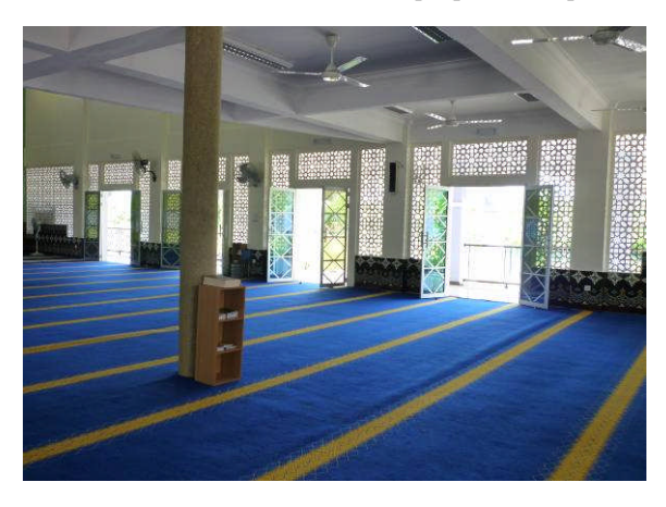
Figure 2. Right side wall mosque with almost optimize use of perforated panel