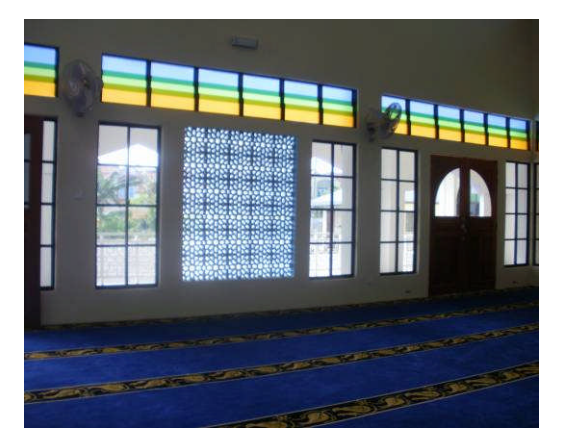
Figure 5. Parts of perforated panel on back wall