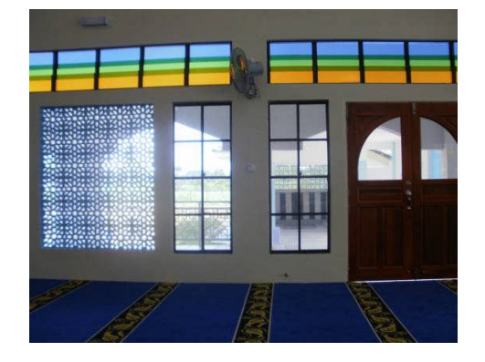
Figure 6. Mosque right side wall consist of perforated panel, glass wall and closed door.

The surface areas and volume of these two mosques were analyzed and calculated based on the architectural drawing provided by Public Work Department (PWD), Johor Bahru, Johor. In addition, site visit were also done to confirm and appreciate the insitu surfaces details in particular its perforated panel surfaces.