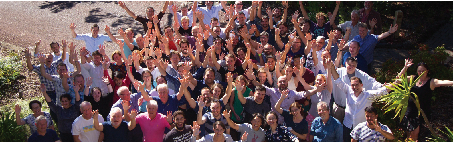
The Marshall Day team team at its 2017 company conference, Pauanui - New Zealand