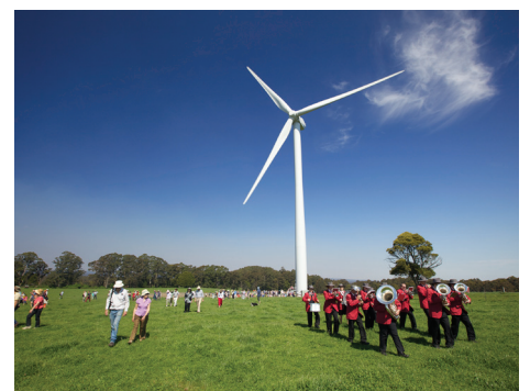
Examples of our environmental projects, top downwards: RAAF Base East Sale (Example N70 contour); Uranquinty Power Station; Hepburn Community Windfarm