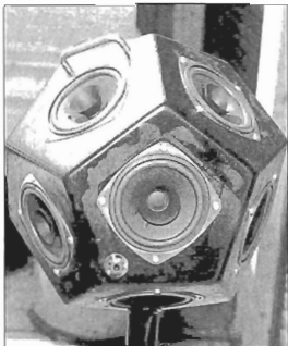
Figure 3. The completed dodecahedral speaker box with speakers mounted.