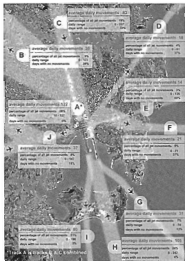
Figure 1 1998 Jet Flight Path Movements

a key reason for their acceptance. A person who lives under one of the flight paths has a 'calibrated ear'—they know what the planes sound like at their home—and they are for the most part not interested in a noise expert giving them information on sound pressure levels (in fact this can often cause deep suspicion because they believe that an attempt is being made to 'snow them' with technical information). The person is just interested in receiving less aircraft overflights, particularly at the noise sensitive times, and the representations in Figure 1 and the 'respite' charts allow them to track what is happening.